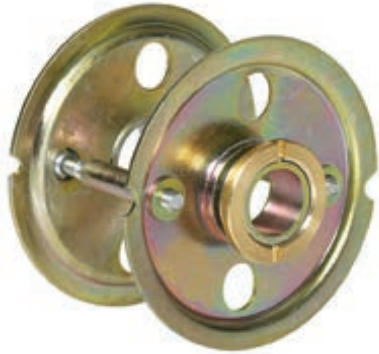
Pre-Bore Adapter 9360-009