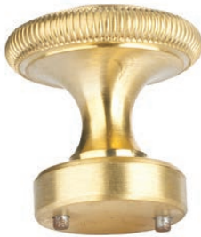
Cam Disc Installation Tool