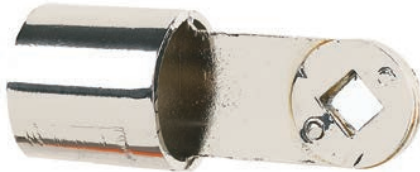
Accepts 7mm (0.272") Spindle