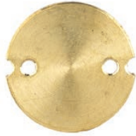
Balance Plug 92020